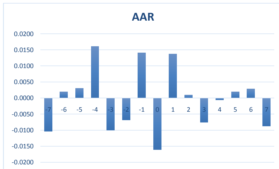
Figure: AAR of stock split announcement

The values of AARs presented in table shows that there are fluctuating returns both positive and negative returns around the announcement day of stock split. The AAR was positive for four days and negative for three days during the seven day pre announcement period. During the post announcement period there was 4 positive AAR and 3 negative AAR but the value of AAR are less as compare to pre announcement period.