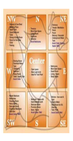
Vastu Purusha (fig.1)