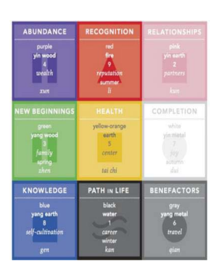
Bagua map (fig.2)