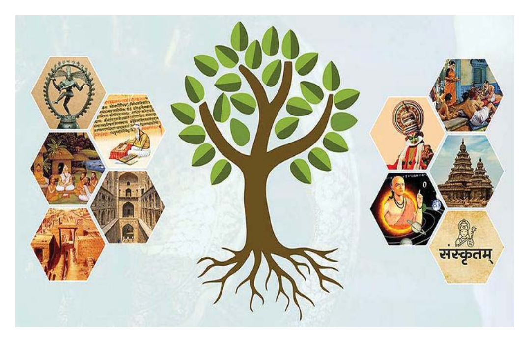
Fig 1: Revitalizing India in a Few Decades (Patukale, 2023)

An International Multidisciplinary Peer-Reviewed E-Journal www.vidhyayanaejournal.org Indexed in: Crossref, ROAD & Google Scholar