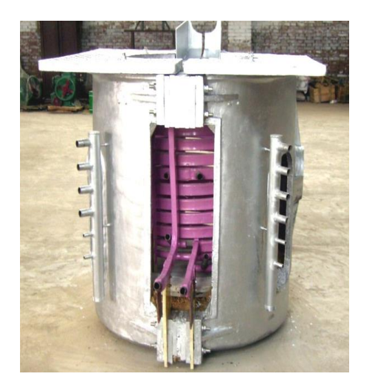
Figure:2 Induction furnace

Due to high power capacity, induction furnaces are widely used in industries. [fig2]. As output product of induction furnace are more qualitative as compared to conventional Gas fired furnace. Ultimately induction furnace are the power full alternative source of Gas fired furnace.[4]